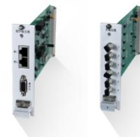
Cards for Flexible modular designed clocks

Modular Time and Frequency Synchronization Platform Automation and Telecom, Versatile and Modular Solution for Time and Telecommunication