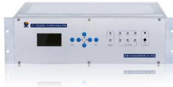
CT-TSS2000 Series Time & Frequency Synchronization Systems

Time and Frequency for Industries, Power Plants, Automation and Telecommunication