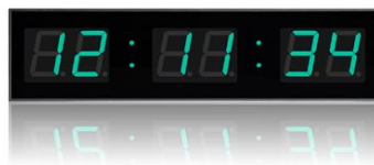
CT-DDT Series Digital Display Clocks

Modular Time and Frequency Synchronization Platform Automation and Telecom, Versatile and Modular Solution for Time and Telecommunication