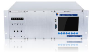
CT-WTFS9000 Grandmaster Clocks

Versatile and Modular Solution for Time and Frequency Synchronization Application in 1U Housing